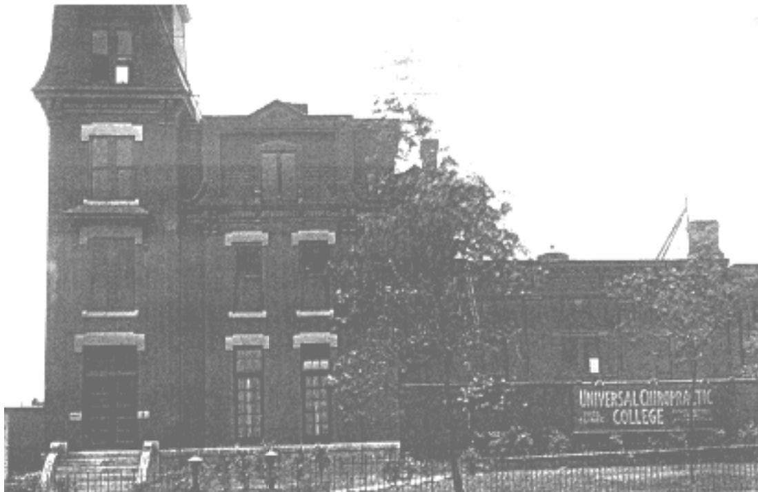
Photo from the Fourteenth Annual Catalog of the Universal Chiropractic College, pp. 6-7 (WSSC Library Archives)

1925 (Mar): Chirogram , published by LACC, reports: -notes lecture by Hugh B. Logan DC on 1/20/25 to LACC student body; Logan is graduate of Universal Chiropractic College and practices in LA (p. 5)