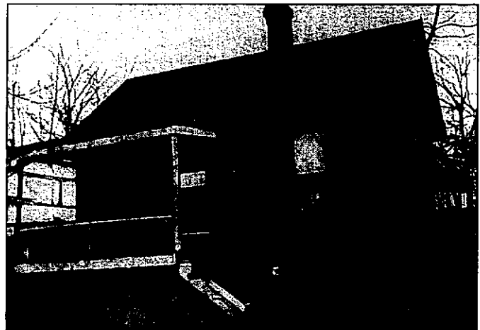
The first location of the American School of Osteopathy