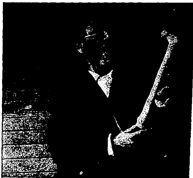
A.T. Still studying a femur.