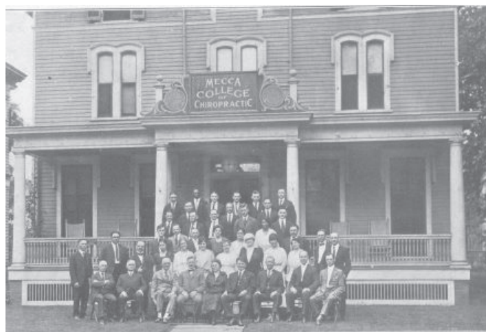
GRADUATING CLASS OF JUNE, 1920 Out of 37 graduates, 31 are high school, college and university men and women.

refers to) the authors migrated to an Access database. The use of this database allows the authors to easily identify all colleges by date, state, college president, key word, or any