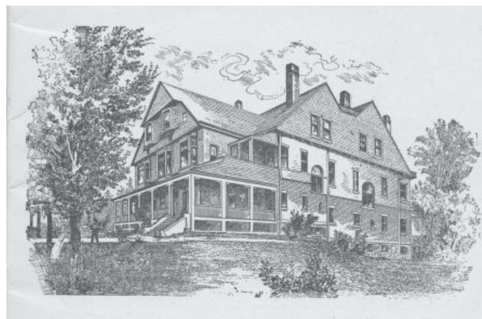
Compressed Chiropractic University and the American Hospital.