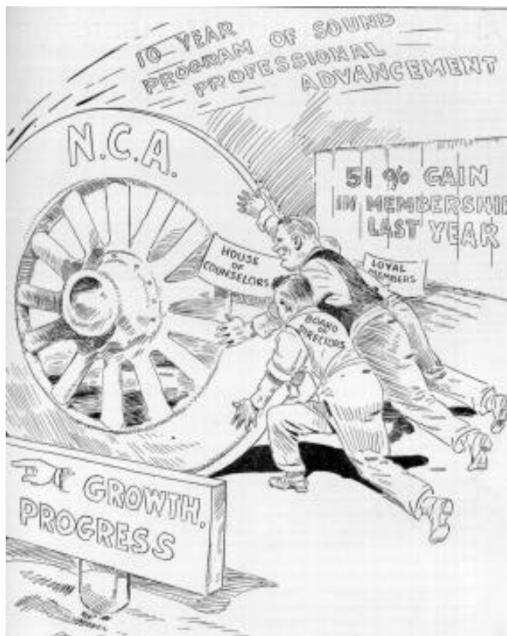
“ALL SHOULDERS TO THE WHEEL - USE APPLICATION ON NEXT PAGE!"; from The Chiropractic Journal (NCA) 1936 (July); 5(7): 57