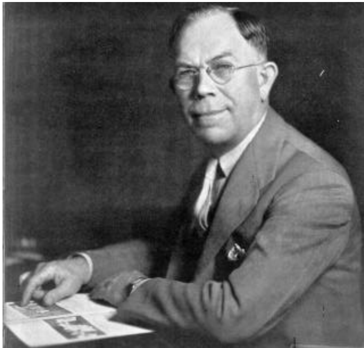
cover of The Chiropractic Journal (NCA), November, 1936