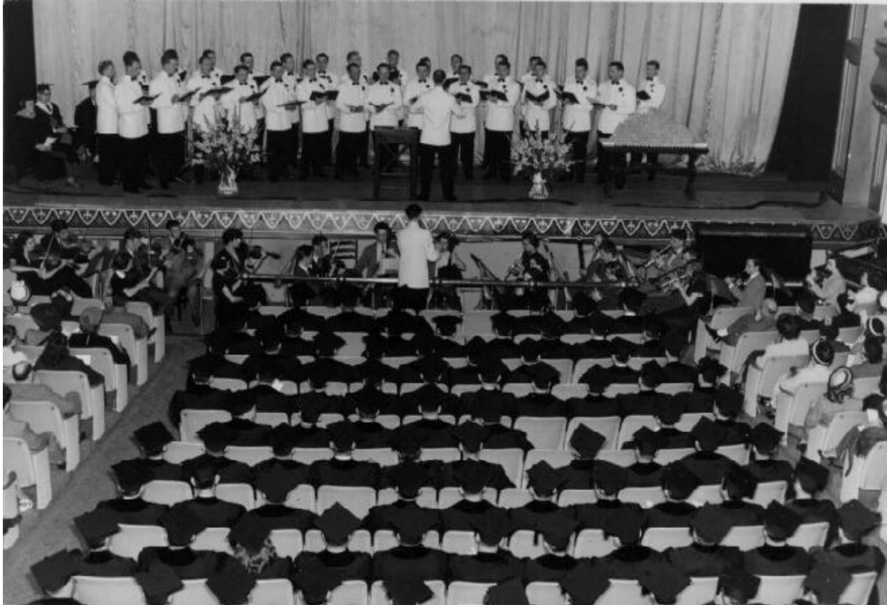
Commencement exercises at Lincoln Chiropractic College of Indianapolis on May 20, 1949, as depicted in the Journal of the National Chiropractic Association 1949 (July); 19(7): 37