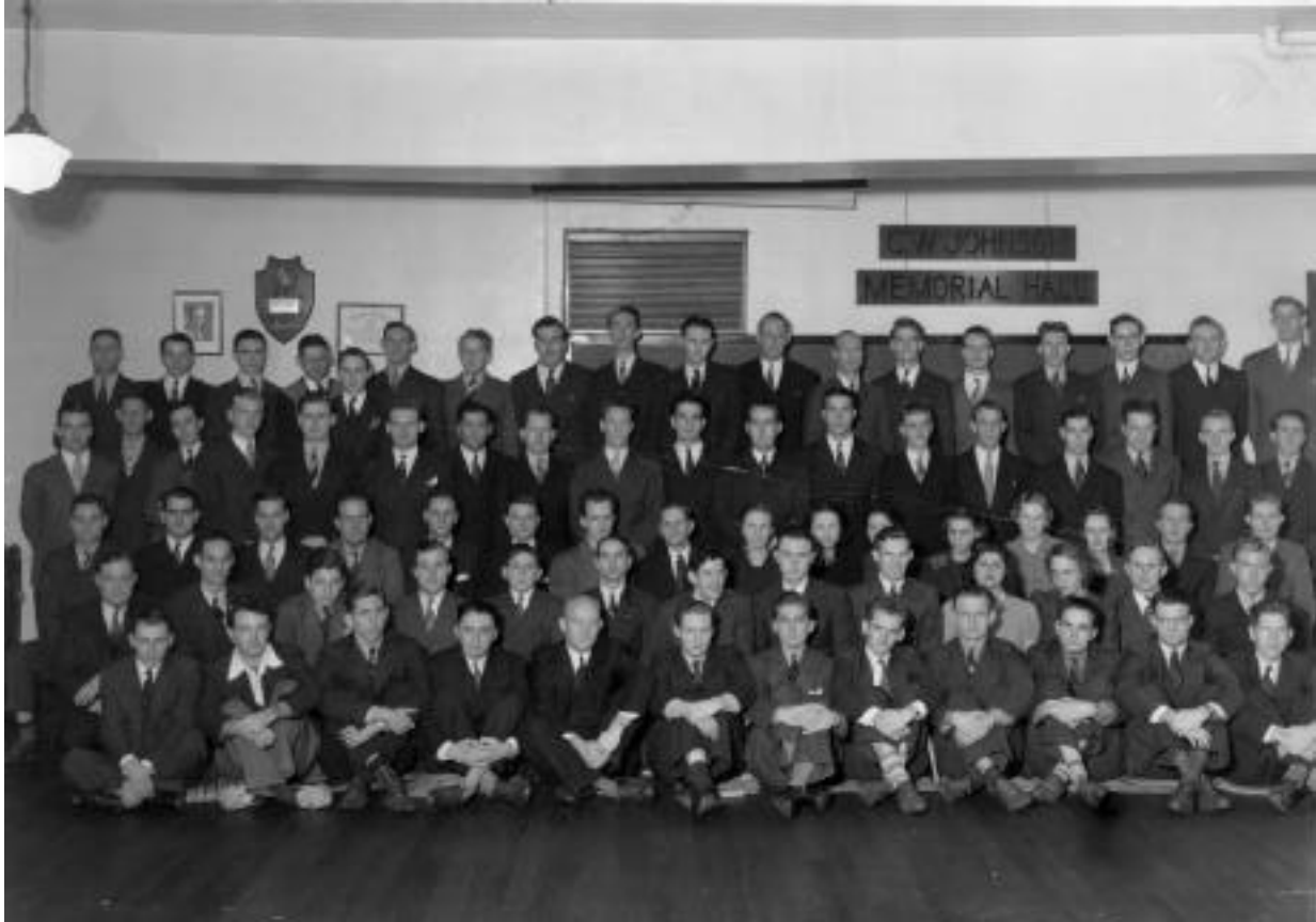
Students of the Lincoln Chiropractic College; from the National Chiropractic Journal 1941 (Jan); 10(1): 15