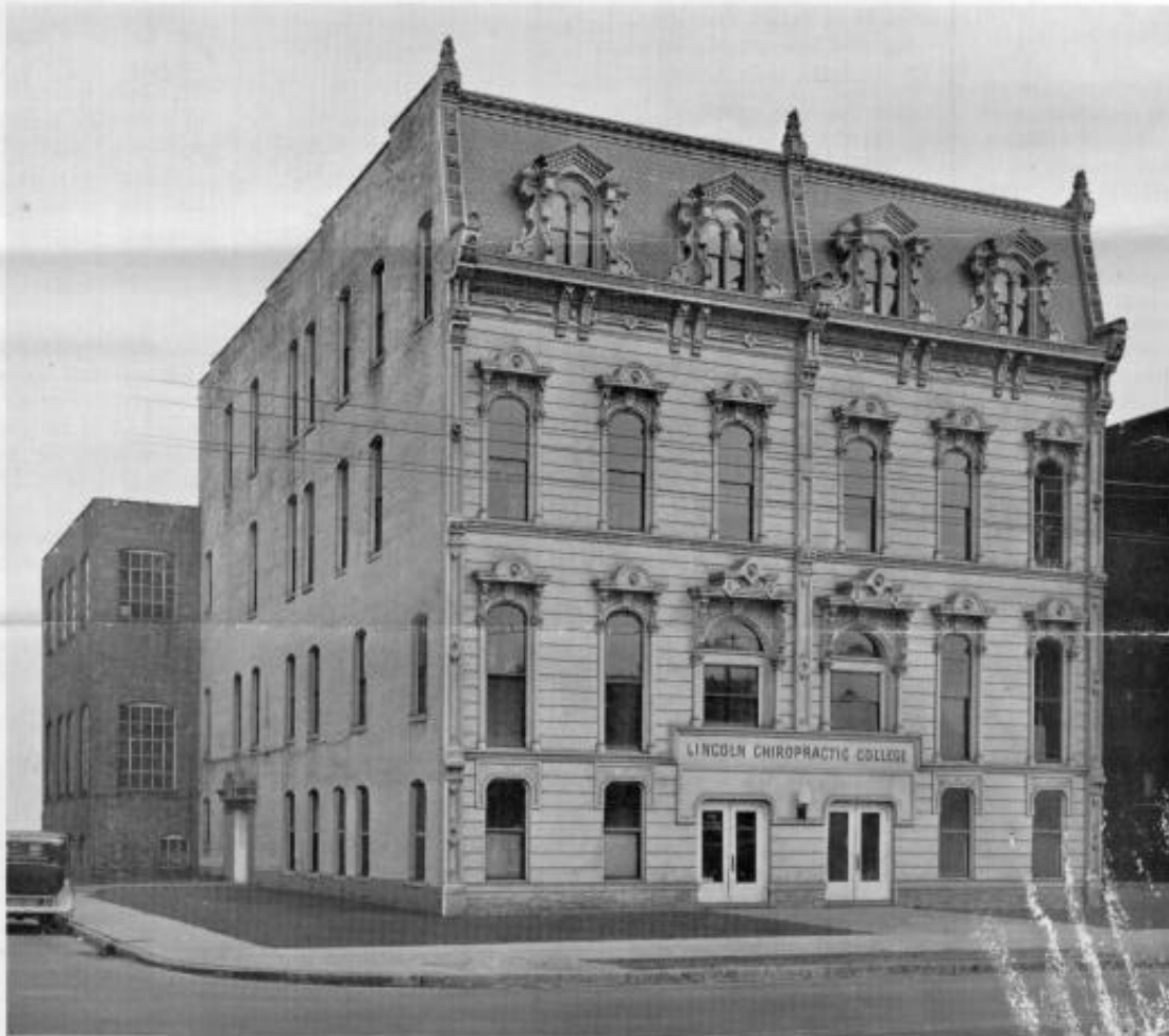
Our New Home

To Be Dedicated At L.C.C. Home-Coming - Aug. 12 to 15th